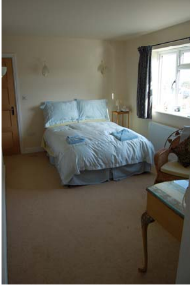
This is the double room at £45.00 Per night